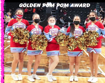
2021 Golden Pom Pom Champions Eagle Butte Braves