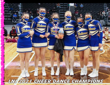
2021 Cheer Dance Champions Todd County Falcons