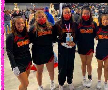
2021 Sportsmanship Award Omaha Nation Chiefs